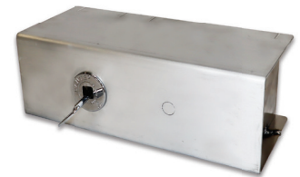
Key Valve / Mounting Bracket